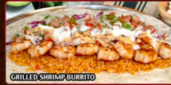
GRILLED SHRIMP BURRITO