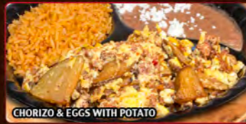
CHORIZO & EGGS WITH POTATO