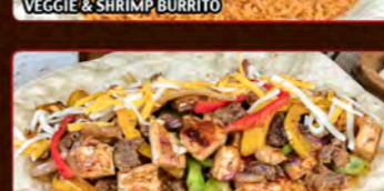
MIX FAJITAS BURRITO