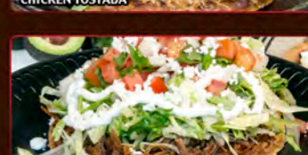
SHREDDED BEEF TOSTADA