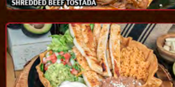
CHICKEN TACO SALAD