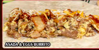
ASADA & EGGS BURRITO