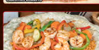
VEGGIE & SHRIMP BURRITO