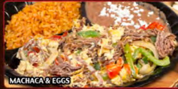
MACHACA & EGGS